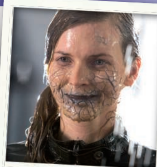
Designing costumes that had to be soaking wet, proved a challenge...